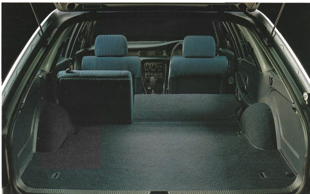
Magna Executive Wagon's cargo area.

Perhaps the innovation that you'll appreciate most is the one you'll never see – the unique five-link rear coil suspension, designed in Australia.