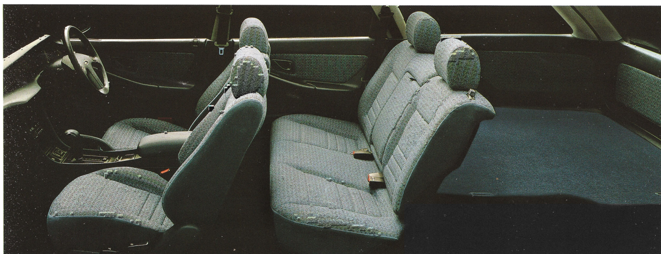
The style and space of Magna SE Wagon's interior.