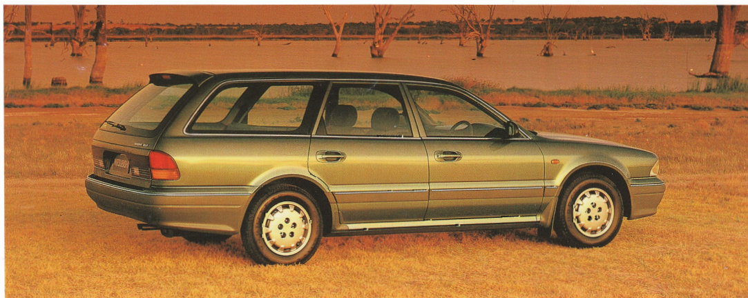
Magna GLX Wagon.

With these and a host of other such thoughtful features, Mitsubishi proves once again that Magna Wagon is in a class all of its own.